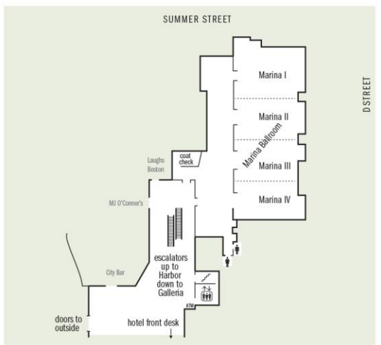
HARBOR WING LOBBY LEVEL